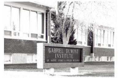
Former GDI Building in Regina

Send your "Meet and Greet" department update to lisa.wilson@gdi.gdins.org