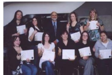
SUNTEP Regina students pose with awards