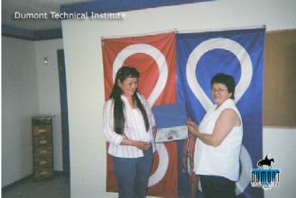
A DTI student receives her diploma.

“DTI provides services to well over 500 students annually and employs more than forty people.”